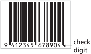
EAN-13 (13 digits) shown at 100% size