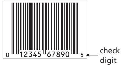
UPC-A (12 digits) shown at 100% size