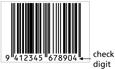
EAN-13 (13 digits) shown at 100% size